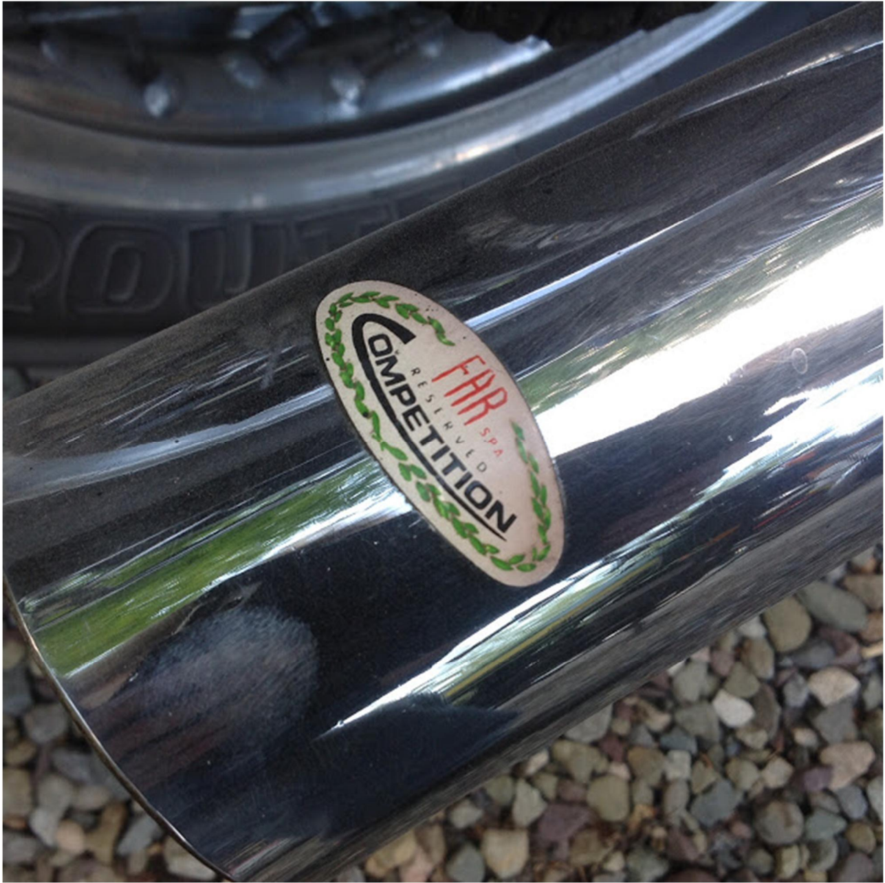
The drum front brake took the most effort, but actually work quite well.