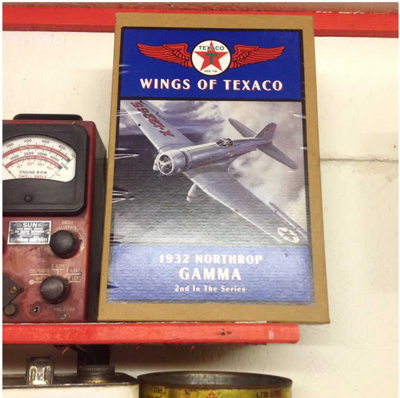
A picture in Bill's garage