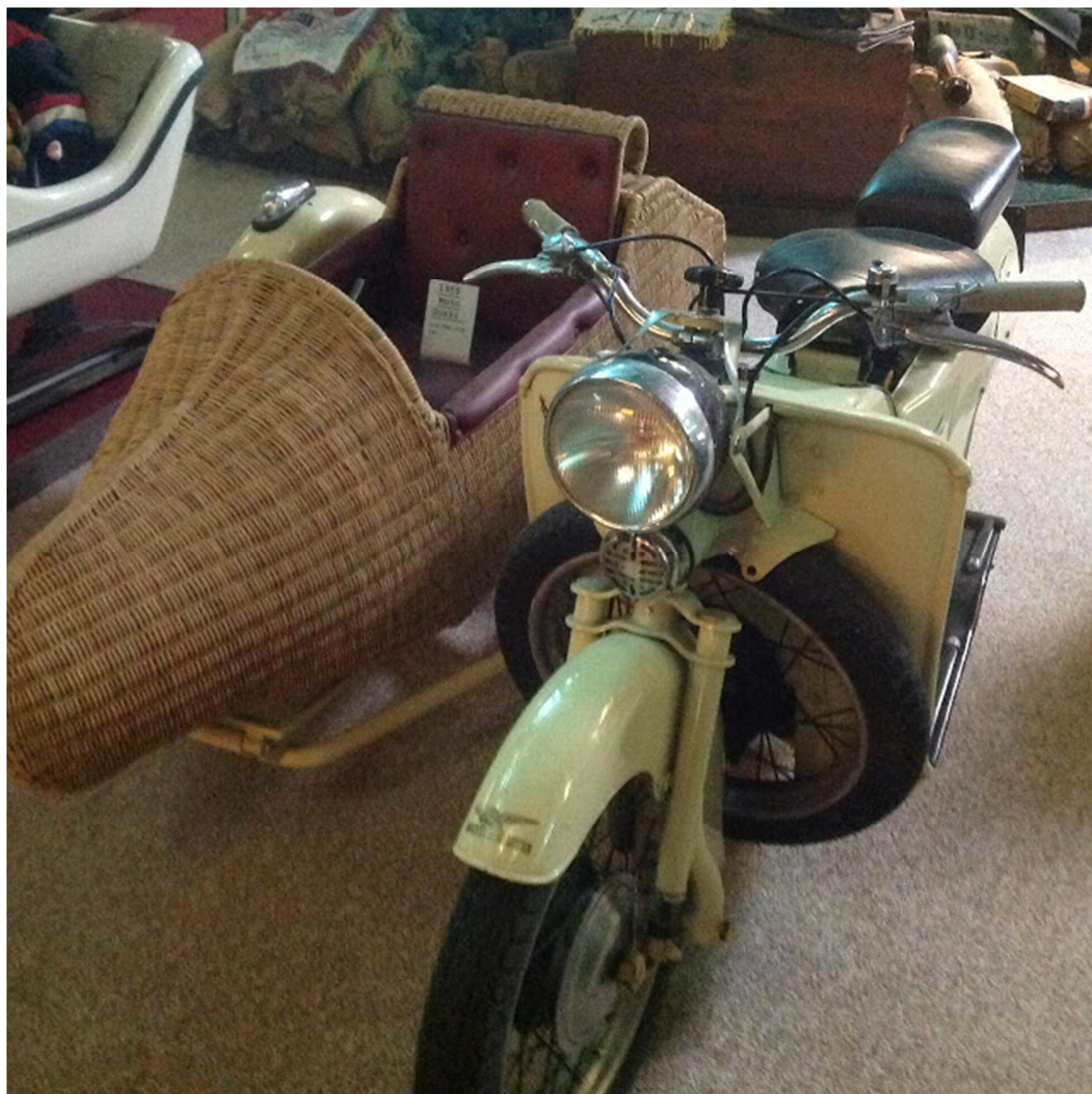
A Moto Guzzi Galletto with a wicker side car