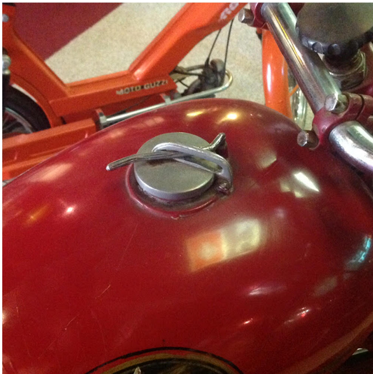
The elegant gas cap on a Moto Guzzi Airone Sport. I have one like this on my Dondolino. Push the lever to the left and it seals the cap; push it to the right and it opens the cap.