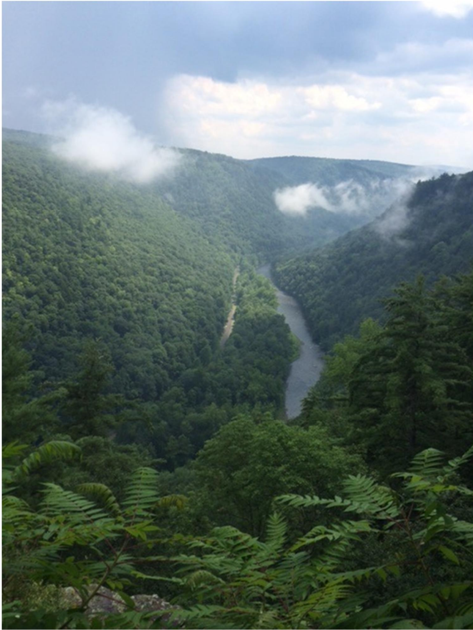
The Pennsylvania Grand Canyon