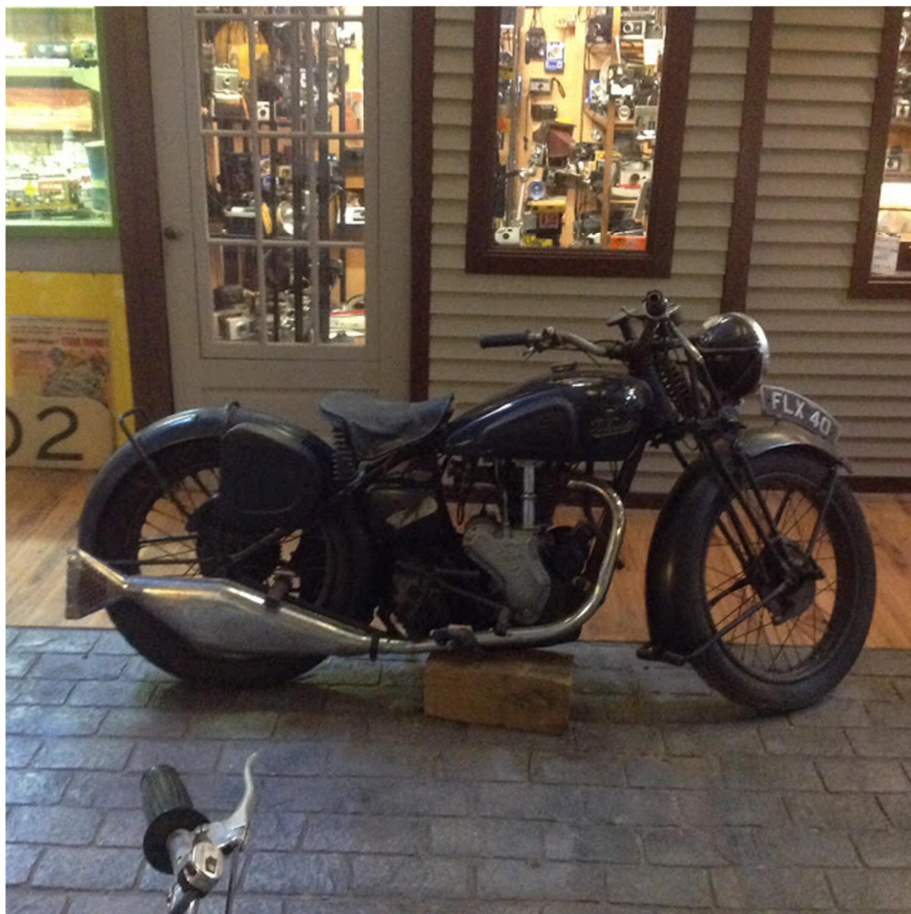
A late 30's Velo MAC in front of the camera store