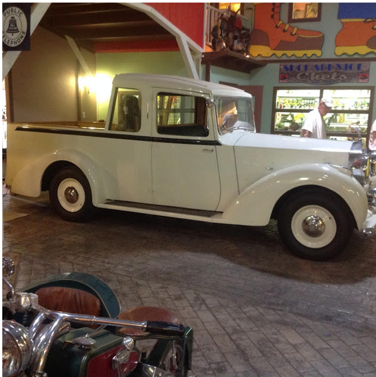
A Rolls Royce pick-up truck