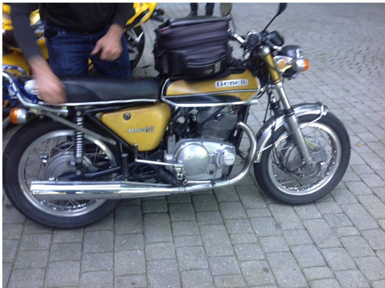
The Benelli Tornado that DIDN'T go on the tour