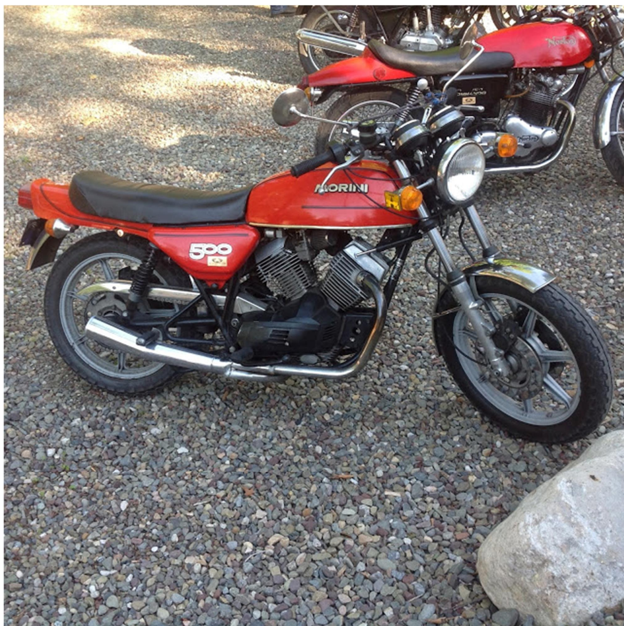
The '78 Moto Morini 500 that was taken in place of the Benelli

We all loaded tank bags on the bike we chose, but we were going to rotate the bikes we rode every 100 or so miles. The tour headed north west with the first stop at Hopewell Furnace National Historic Site, one of the earliest place iron was smelted in the U.S. Joel was eager to show us the bellows powered by a big water wheel which got the charcoal fired furnace up to a temperature to smelt iron ore and we caught a demonstration of sand casting that was used to make plates to build stoves.