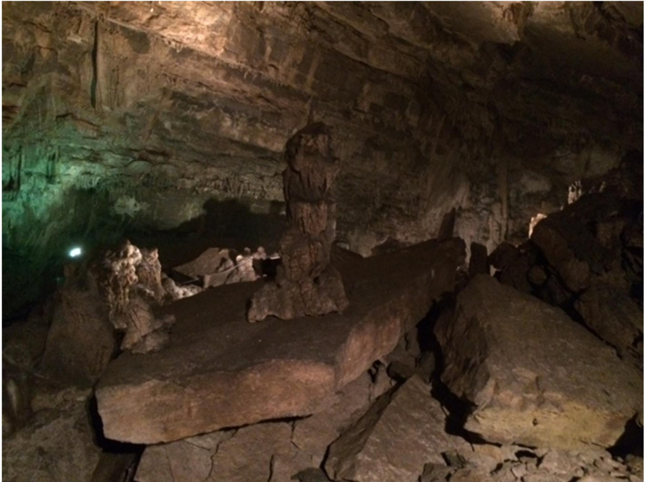
Inside Woodward Cave