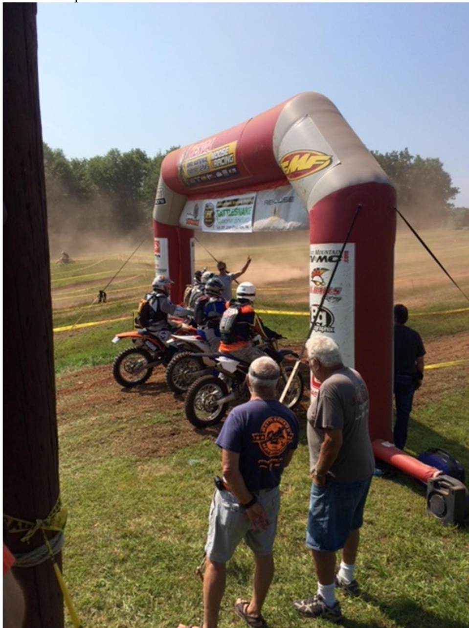
One of the 104, five rider starts to Section one of the Rattlesnake Enduro

Bob Gould sent me some photos he took from our Retro Tour: