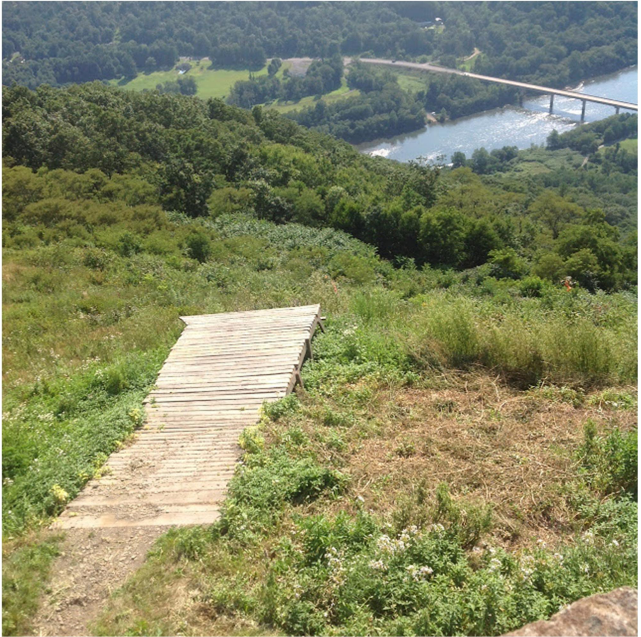
This is the ramp the hang gliders pump off