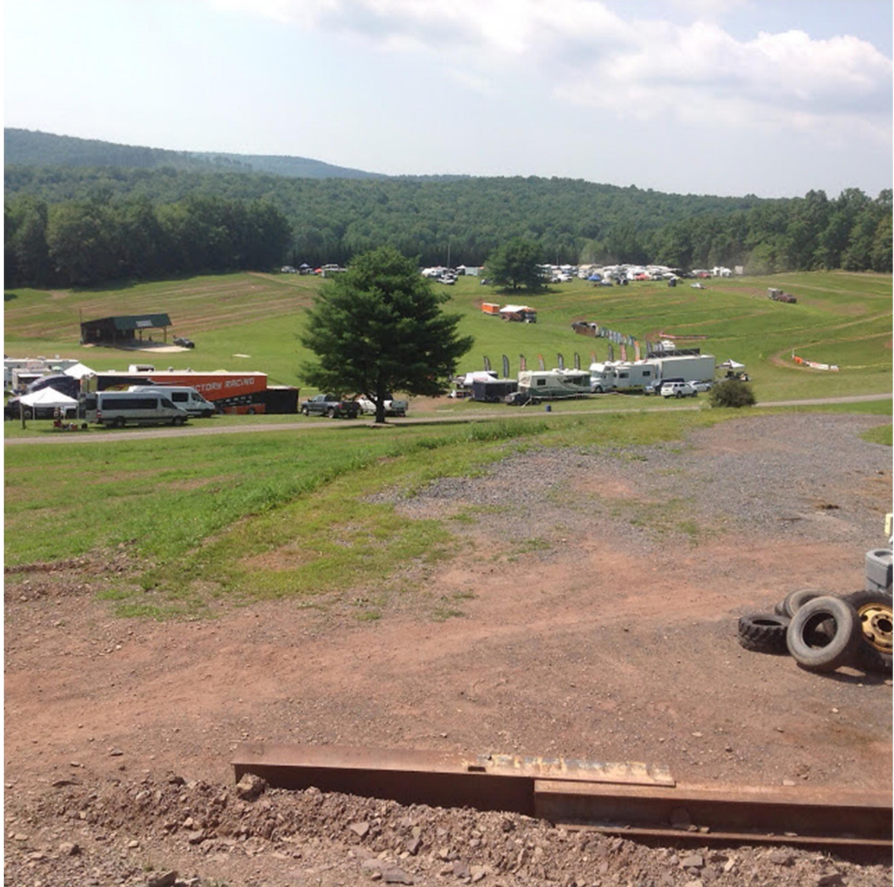
The Rattlesnake National Enduro started in this field.

to the Enduro turned into a 50mi ride. But, it was a gorgeous 50 mi. ride with the last bit a fun dirt road to the first section of the Enduro. The local fire company was serving a killer breakfast after which we watched the first section. Apparently, Enduros have changed quite a bit recently, and now there's no penalty for being early, but that's unlikely anyway as the average speed is set very high and virtually every one loses point for being late. So, it seemed like a hare scrambles except riders were sent off in groups of five. The first section was a 6.1 mile loop that started as a series of switchbacks in a big field, then went into the woods, back into another field, back through the woods, and back to the start.