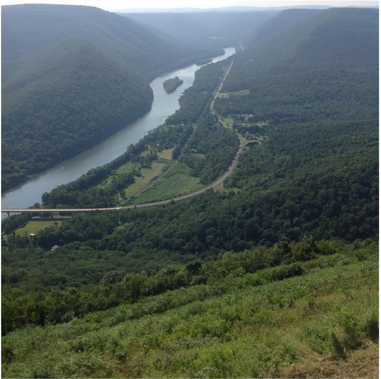
Hyner View looking northwest

Apparently, this is a popular spot for hang gliding, but unfortunately, none was going on while we were there.