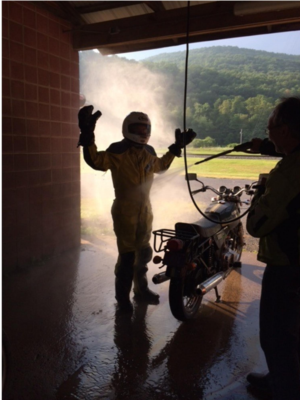
Getting hosed off at the car wash